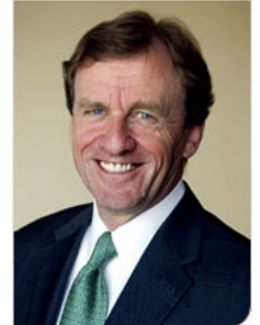
Allan Rock, Recteur et vice- chancelier/President and Vice-Chancellor

Le 26 octobre 2008, Allan Rock a officiellement été nommé 29 e recteur et vice-chancelier de l'Université d'Ottawa. À ce moment, il avait annoncé un plan qui ferait du « service aux autres » une partie intégrante de l'identité de l'Université d'Ottawa et de l'expérience étudiante. Il a par la suite fondé le Bureau du service civique. Les idées de M. Rock ont été accueillies très favorablement par le Centre de recherche sur les services éducatifs et communautaires (CRSEC), étant donné notre mission qui consiste à collaborer à des activités de recherche, d'évaluation et de formation et à améliorer les politiques et les programmes destinés aux citoyens vulnérables. M. Rock a accepté de s'entretenir avec nous pour que nous discutions de ses idées en plus amples détails et pour que nous voyions comment elles se rapportent au travail qui est effectué au CRSEC.